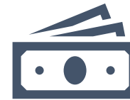
25% LESS THAN SERVICED