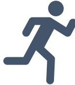
SPEED TO MARKET