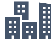
OWN YOUR OWN SPACE