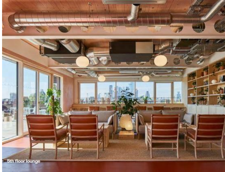
5th floor lounge

Sitting on the bank of the Regent's Canal, the waterside space features private and communal roof terraces with inspiring views across the City and along the canal.