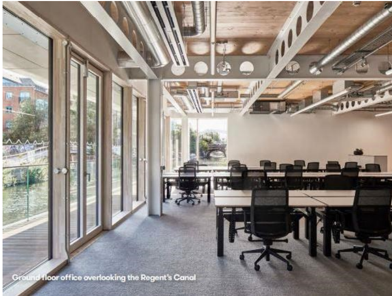
Ground floor office overlooking the Regent's Canal