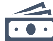
25% LESS THAN SERVICED